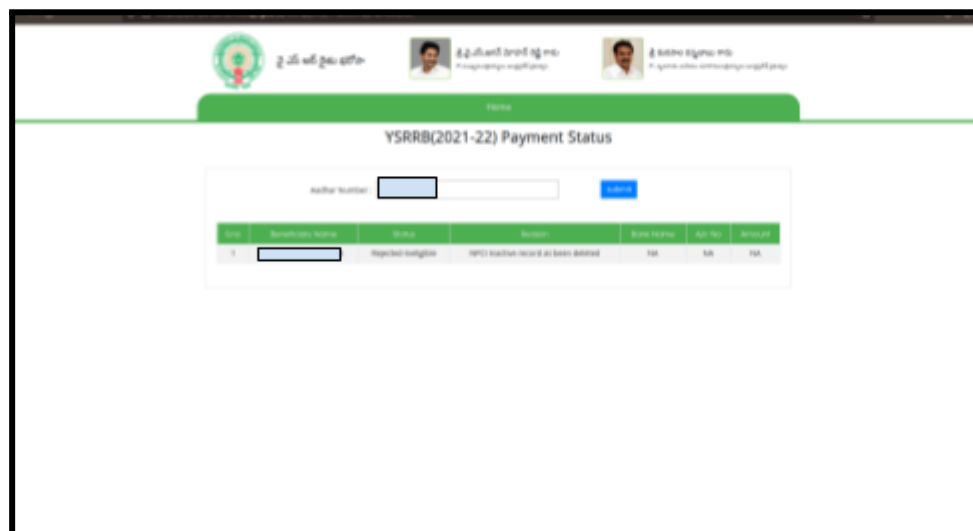
Figure 1-Rythu Bharosa Status as on 21st May 2021