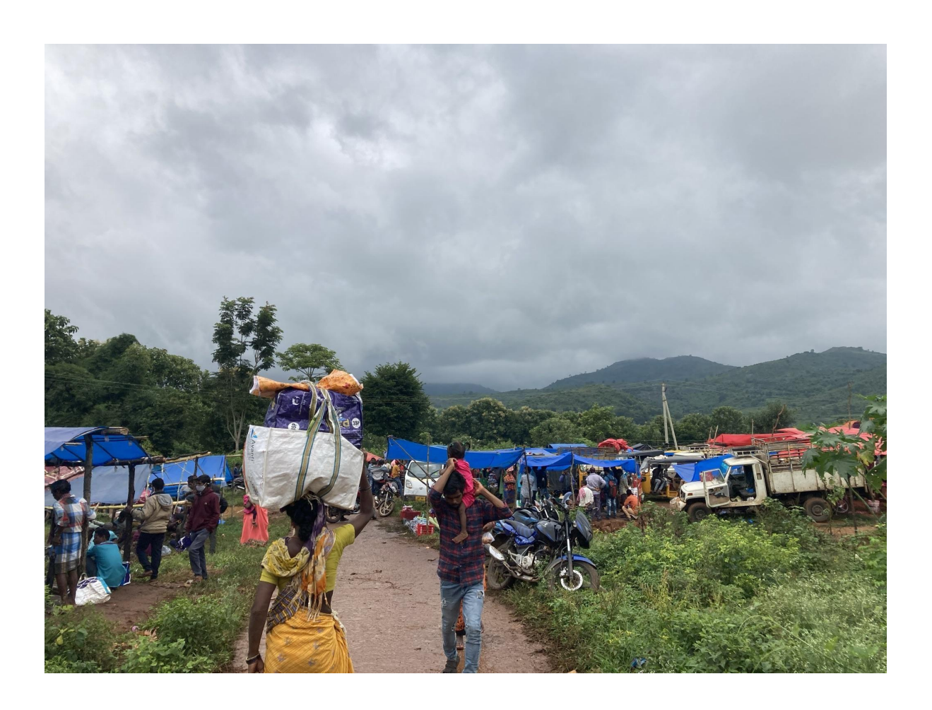
Employment Status in Andhra Pradesh Mahatma Gandhi National Rural Employment Guarantee Act April 2022 to January 2023